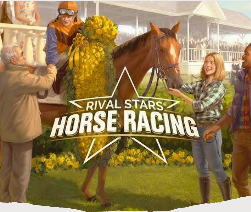
Rival Stars: Horse Racing