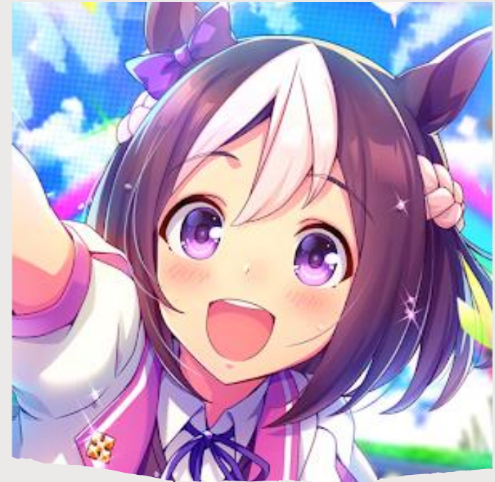
Umamusume: Pretty Derby