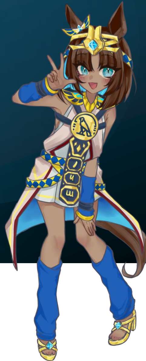
Fan Art "American Pharoah"